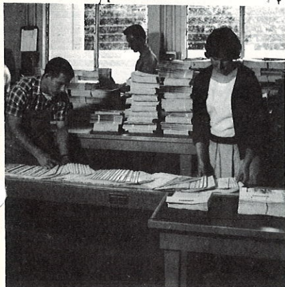
The PLAIN TRUTH mailing staff at work.